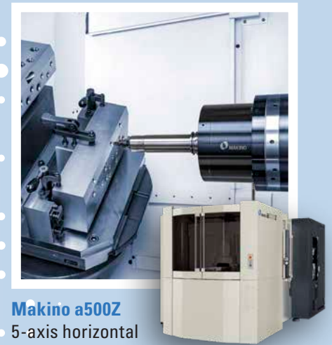
Makino a500Z 5-axis horizontal machining centre