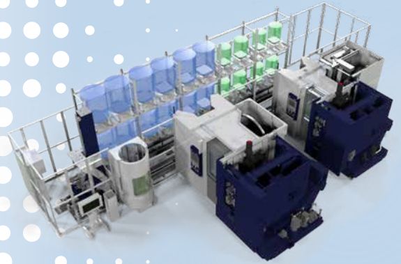
New: Makino PZ1 Flexible manufacturing system

Kruichling 18, 73230 Kirchheim unter Teck, Germany Tel.: +49 (7021) 503-100 · Fax: +49 (7021) 503-400 www.makino.eu