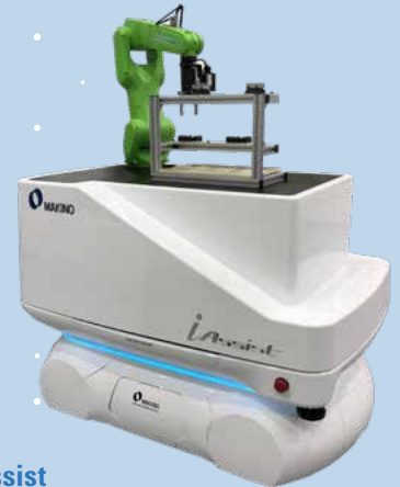
iAssist Mobile autonomous robot